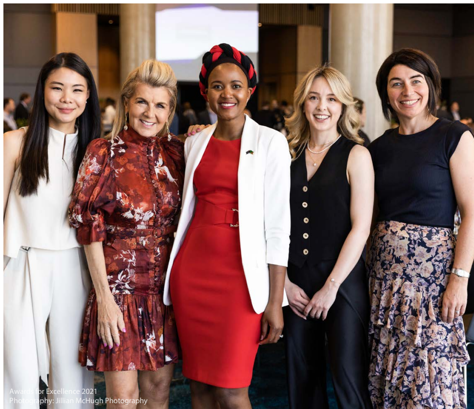
Award for Excellence 2021